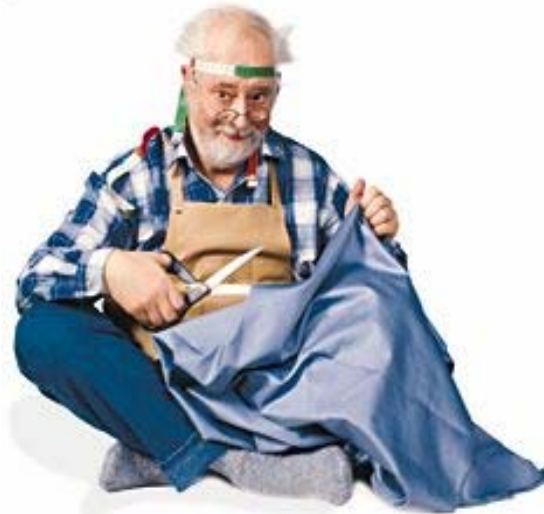
T. Khauo OCR 2000