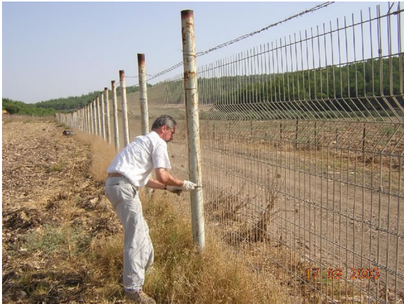
T. Khauo 0

repaired; patched or fixed something old to make it usable again